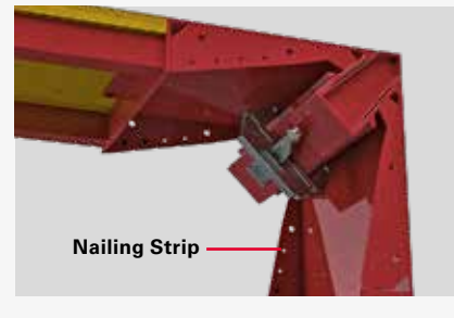
Adjustabil formlining thickness Nailing Strip

The VARIO Element VE is a patented, modular Box-Out Formwork for windows and variable recesses. The assembly can be carried out quickly and easily after a short briefing. Plus: Only a minimum of components are required for the assembly process. Due to its simple handling, you can save valuable time on the construction site and reduce your labour costs.